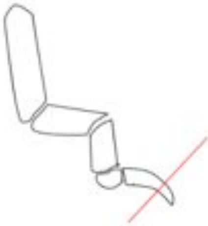
Where to cut a dog's toe nail.

The image shows how the bones of the paw and wrist angle back when a dog has long nails, but the damage doesn't stop there. All the bones in a dog's body are connected and the leg bones connect all the way up to the spine. Some of you might relate to how an injury on one part of our body can cause us to carry ourselves differently and create pain in another part of our body. Unfortunately, our dogs can't tell us when they have a headache or shoulder ache and many times we miss the slight signals that they are in pain. Since dogs can't trim their own nails, it's up to us to make sure this dog maintenance is performed before the pain sets in.